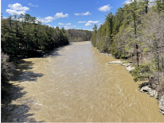
Above: Presumpcot River Below: Flash flooding on Fox Street in Portland

Help Maine identify ways to address stormwater pollution to protect our waterways, economy, and way of life.